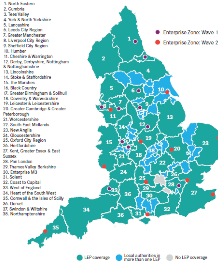
Figure 2: Enterprise Zones - the haves and the have-nots

Map taken from the Centre for Cities report into the effectiveness of LEPs to date, titled “Cause célèbre or cause for concern? Local enterprise partnerships one year on”